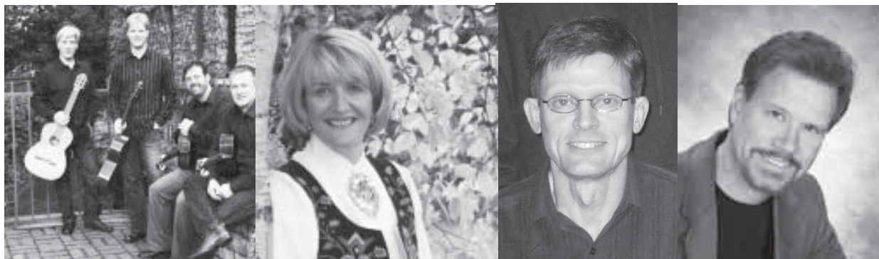
Minneapolis Guitar Quartet